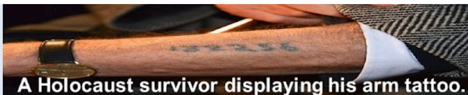
A Holocaust survivor displaying his arm tattoo.