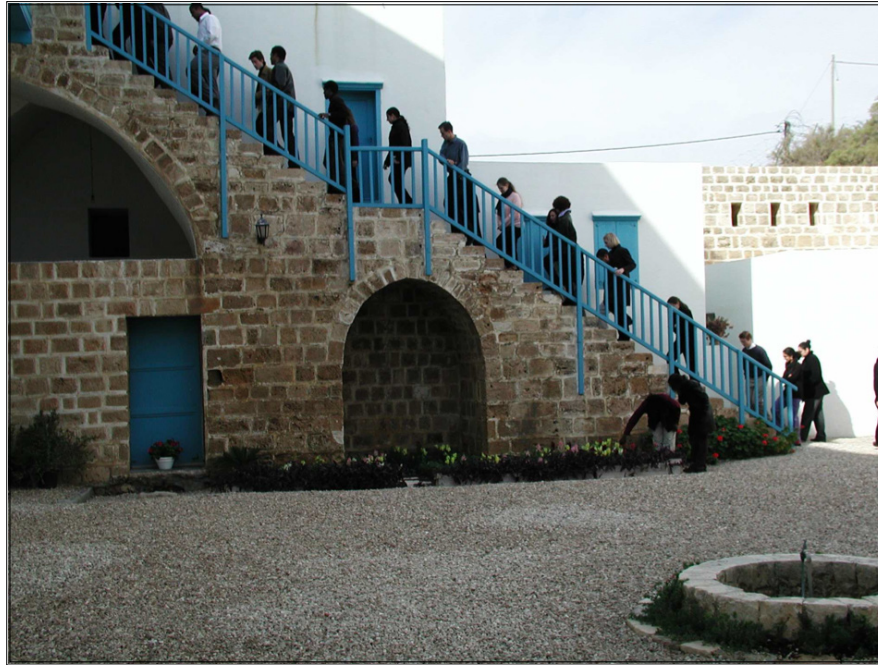
Pilgrims climbing the stairs in the courtyard of the House of 'Abdu'lláh Páshá