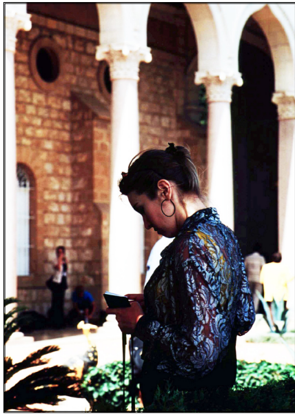
Pilgrim praying outside the Shrine of the Báb

and scheduling group pilgrimages. The shared evening meals were replaced by an afternoon tea during which the pilgrims could mingle with the members of the Universal House of Justice, who now took turns giving evening talks to the pilgrims. Members of the International Teaching Centre assumed the responsibility of accompanying the pilgrims and reciting the “Tablet of Visitation” during their initial visit to the Shrine of the Báb, which now involves a group circumambulation, since the space inside is insufficient to accommodate an entire group.