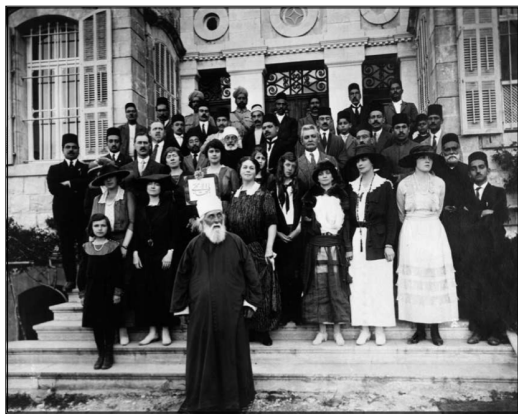
'Abdu'l-Bahá with pilgrims from the East and West in front of His home in Haifa (1920)

It was customary for pilgrims at that time to seek permission before embarking on pilgrimage, although some apparently did not wait for a response. A typical pilgrim would arrive in Acre and be welcomed by 'Abdu'l-Bahá, who would make arrangements for his or her lodging and prepare them for the experience of meeting the object of their journey, Bahá'u'lláh Himself. The pilgrims generally stayed until Bahá'u'lláh gave them leave to depart, and as a result, the duration of the pilgrimage varied from a few days to several months.