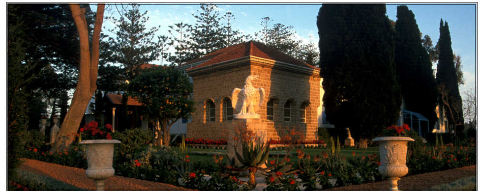
The Shrine of Bahá'u'lláh

The practice of pilgrimage to the Bahá'í Holy Places in Haifa and the Western Galilee is an integral part of the belief system and community life of Bahá'ís, and it has acquired a traditional character that is comparable to that of pilgrimage in other religions. Circumambulation, removal of footwear and the recitation of the specially designated “Tablet of Visitation” in connection with visits to the Shines of Bahá'u'lláh and the Báb, and the receipt of guidance and spiritual nourishment through direct meetings with the leadership of the community are among the traditional practices that have characterized Bahá'í pilgrimage throughout the years and provide a sense of continuity that will project into the future.