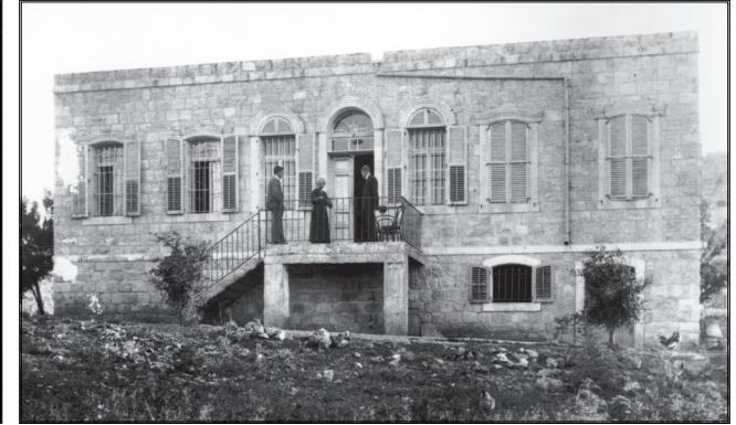
Left: 'Abdu'l-Bahá walking towards the Old Western Pilgrim House (1921) Right: Several pilgrims standing on the porch of the same building

entry, and the recitation of a particular text from the scriptures entitled the "Tablet of Visitation". The pilgrims were received by 'Abdu'l-Bahá, who met with them personally on a daily basis, rejoicing their hearts with affectionate words of advice and encouragement, answering their questions and illuminating their understanding with his explanations of the teachings of the Faith.