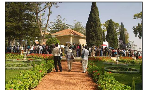
Pilgrims entering the Shrine of the Báb (left) and circumambulating the Shrine of Bahá'u'lláh (right)