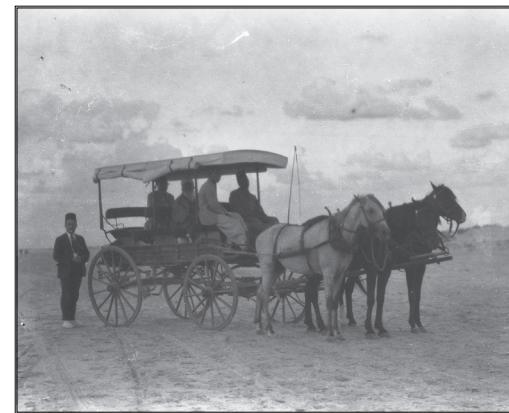
'Abdu'l-Bahá traveling with pilgrims from Haifa to Acre along the beach (1921)

While Bahá'u'lláh was alive, pilgrims came to the Acre area from Iran and other countries of the Middle East with the purpose of attaining His presence. From the period of Bahá'u'lláh's imprisonment in the Acre Citadel, there are accounts of pilgrims who, after traveling on foot from Iran, were obliged to return home in the same way,