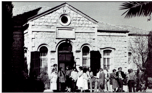
Pilgrims in front of the Pilgrim House in Haifa

in the time of Bahá'u'lláh, pilgrims sought the permission of the head of the faith before arriving or leaving, resulting in stays of variable duration.