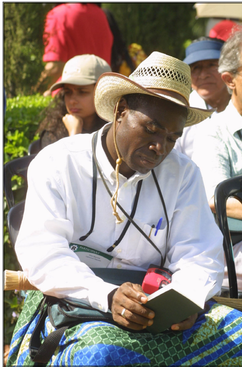
A pilgrim praying in the gardens