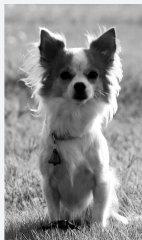
Momo, an unusual dog