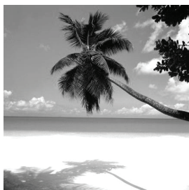
Picture of the beach where the camera was lost.