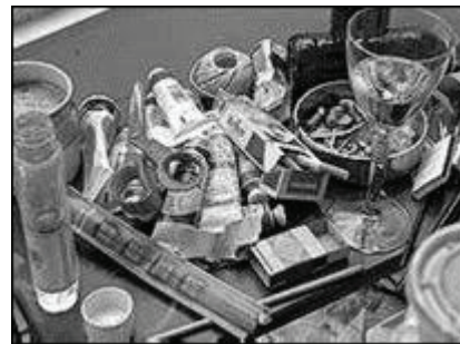
Work by Damien Hirst

A funny incident happened at a modern art gallery in London. One 10 morning the cleaner came into the gallery to clean up after a party. While cleaning, he noticed that one of the tables was covered with cigarettes, empty bottles, coffee cups and candy wraps. He thought it was trash and threw 15 everything in the garbage can. The cleaner didn't know that he threw away an expensive piece of modern art by the British artist Damien Hirst. The art represented his messy art studio. Luckily, the "trash" was found 20 and was put back together.