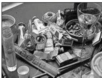
Work by Damien Hirst

A funny incident happened at a modern art gallery in London. One 10 morning the cleaner came into the gallery to clean up after a party. While cleaning, he noticed that one of the tables was covered with cigarettes, empty bottles, coffee cups and candy wraps. He thought it was trash and threw 15 everything in the garbage can. The cleaner didn't know that he threw away an expensive piece of modern art by the British artist Damien Hirst. The art represented his messy art studio. Luckily, the "trash" was found 20 and was put back together.