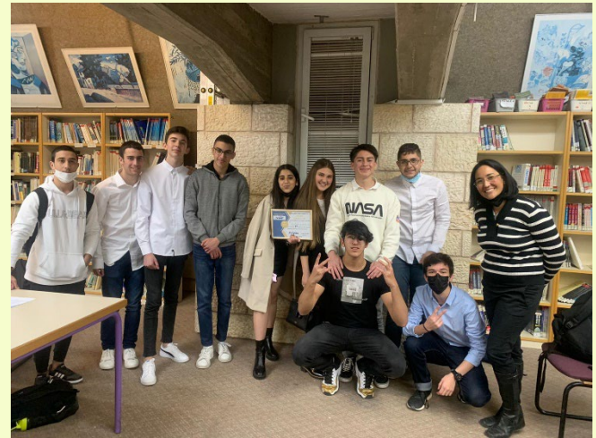
The team from Amal Space and Aviation