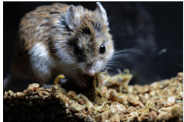
A southern grasshopper mouse ( Onychomys torridus ) capturing and eating the painful species of scorpion ( Centruroides sculpturatus ).