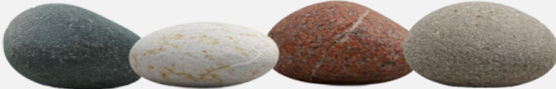
Encounters within Israeli society